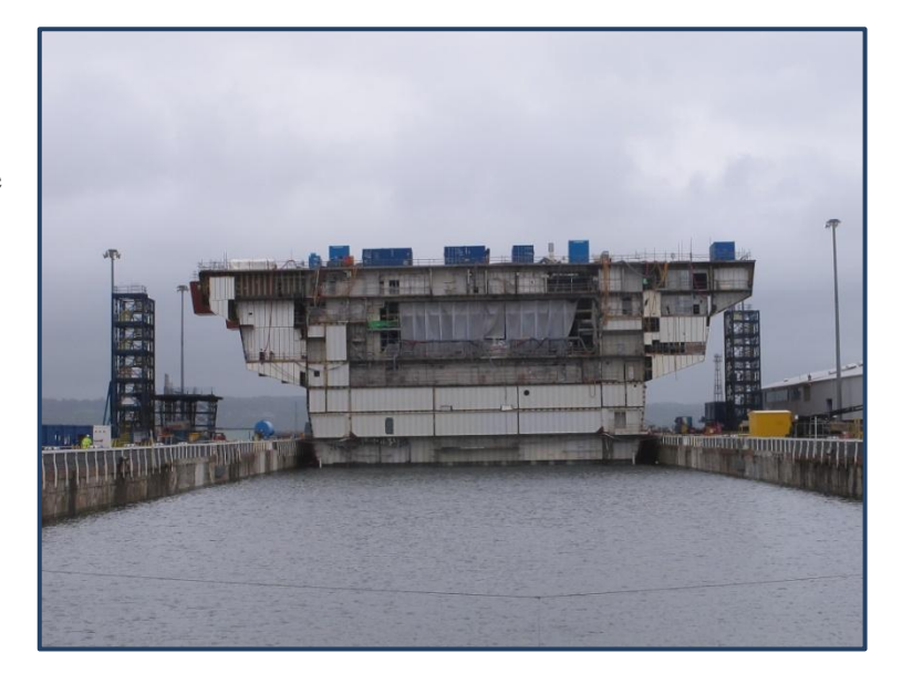
The next day, on June 9, SB03 was manoeuvred out of the dock.

On June 8 the dry dock was flooded and Super Block 03 (SB03), the centre section of the ship, was gently floated up for the first time.